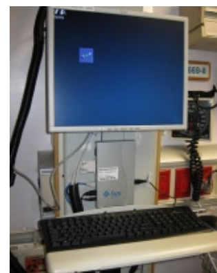
Sun Ray device at patient bedside.

Initial feedback from the ED staff has been very positive, and plans for an implementation in the Emergency Department at the Upper River Valley Hospital are underway.