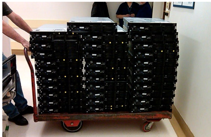
An example of some of the servers removed as part of the Server Virtualization Project.

Fredericton, Saint John and both sites in Moncton have been using server virtualization for several years, with tremendous success and countless benefits. As part of this project, server virtualization will be rolled out to the remaining four Zones in the coming months in hopes of completing the project by the summer of 2011.